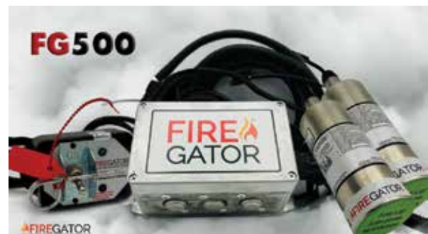
FireGator® extinguishing units are compact and modular

FireGator suppression agent is UL listed for Class A surface, Class B, and Class C fires, providing broad protection for mixed fuel and electrical hazards.