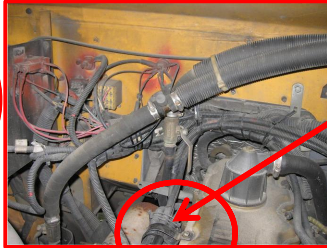
Proper P-Clamp of wires above exhaust manifold.

When inspecting units we are still noticing that some units still have zip ties securing wire looms above the exhaust manifold. Wiring looms above the exhaust manifold should not be secured with zip ties. They should be P-clamped to the valve cover to avoid failure of zip ties due to heat per SF249A. Zip ties this close to the exhaust heat can weaken over time and then allow the wiring to drop down on hot exhaust components. See Photos. A copy of SF249A is posted on our website for your convenience in the Carolina Thomas Bus Buzz section.