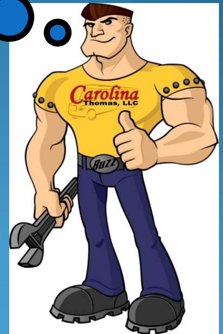
Carolina Thomas Bus Buzz # 3

Here is something to look for that may not be obvious.