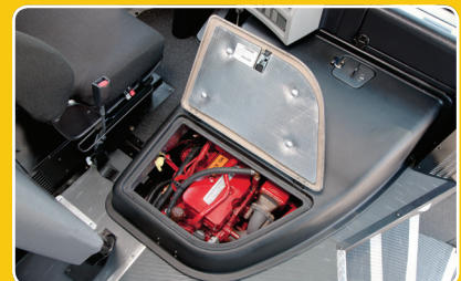
Engine access provides wider aisle for passenger loading and quieter ride for drivers.