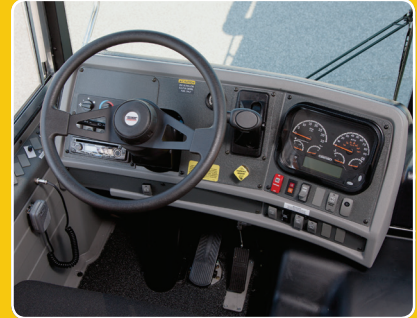
Cockpit design allows for better driver comfort.

* Some options only available through dealerships