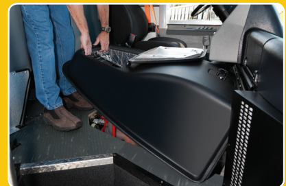
Easy engine access with no tools required.